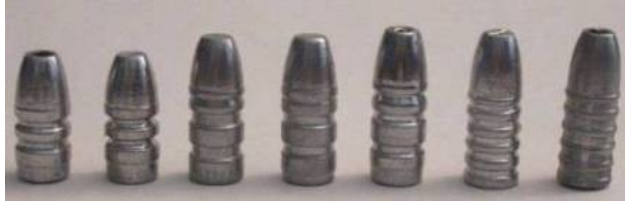
Cast bullets used in this loading project; (l-r) Lyman 257420 HP, 257420 solid, Ideal 257283, H&G #54, Ideal 257312 HP, Ideal 25720, and Ideal 25727 HP.

In terms of powder selection, there is load data out there for the .25-20 for powders ranging from about Red Dot on the fast side, up to Acc. Arms 2015 BR on the slow side, with 4227 appearing to be just about optimum (and 4227 has been a historical favorite in the .25-20). Generally speaking, for a cast bullet project, I like to work with powders on the slow side for the application as slower pressure rise early on allows the bullets to be engraved