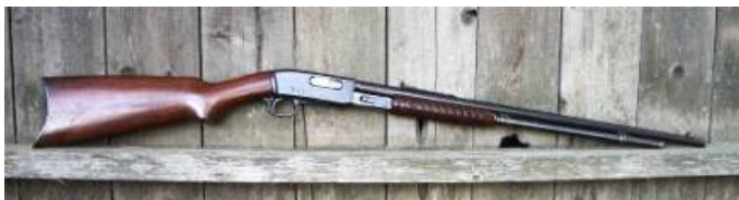
Remington Model 25, a 5 1/2 pound pump action .25-20

A variety of guns have been manufactured in .25-20 over the years, but the one that caught my eye was the sleek little Remington Model 25. Remington made a total of almost 32,000 of these dainty little 5 ½ lb pump-action rifles between 1923 and 1936. A good friend of mine made me a deal I couldn't refuse on one of these sweet little rifles (24" barrel), and a casting/loading project was under way.