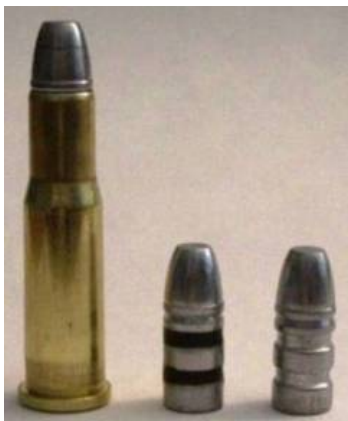
.25-20 loaded with the Ideal 257283 and the same bullet sized and lubed and as-cast.

(SWC), but that name wasn't in common usage at that time. It has 2 large grease grooves and a beveled crimp groove. The base band is MUCH thicker (.125") than those on the 25720 and the Winchester bullet (a thicker base band helps to seal the gases behind the bullet). This is a fine bullet for hunting small game. It was last cataloged in 1964. Testing showed that this bullet design seems to be more accurate than the earlier designs (the design of the lube grooves also makes this bullet MUCH easier to cast). The best load tested was 8.0 grains of 4227, which produced 1680 fps with excellent accuracy. Without question, this is my preferred small game hunting load for this gun. Faster powders like Unique and HS-6 were not as accurate.